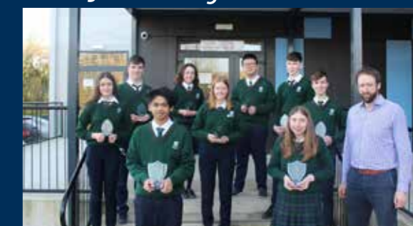
Junior Certificate 2021