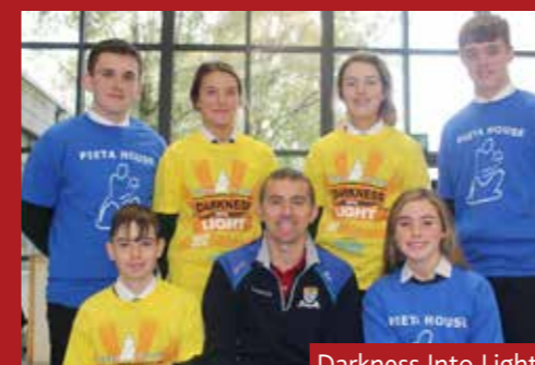
Darkness Into Light