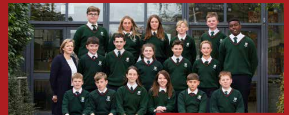
Junior Council 2019

"Lessons were very well prepared and had a clear, purposeful structure"