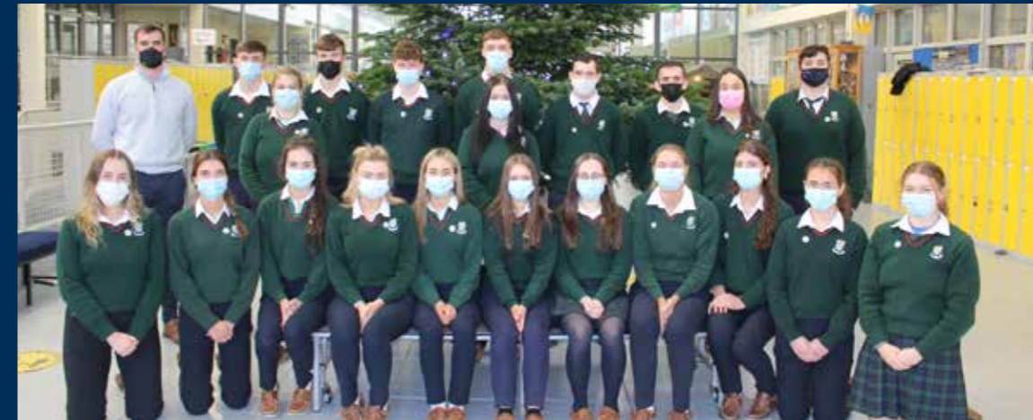
Recent Student Leaders in CCS

Leadership Day is a School initiative which acknowledges the achievements of students who take leadership roles in our school. It celebrates students who model good example, commitment and positivity in the school.