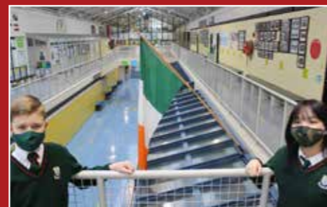
Junior Winners, Irish Flag Competition