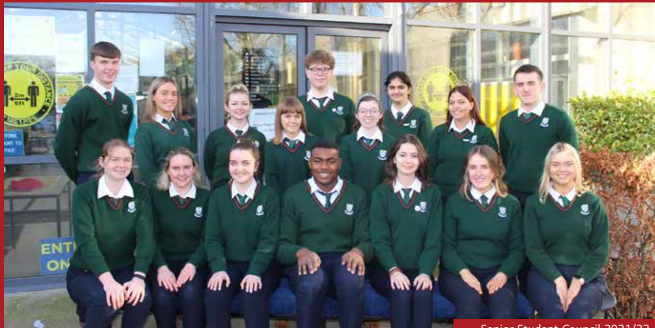
Senior Student Council 2021/22