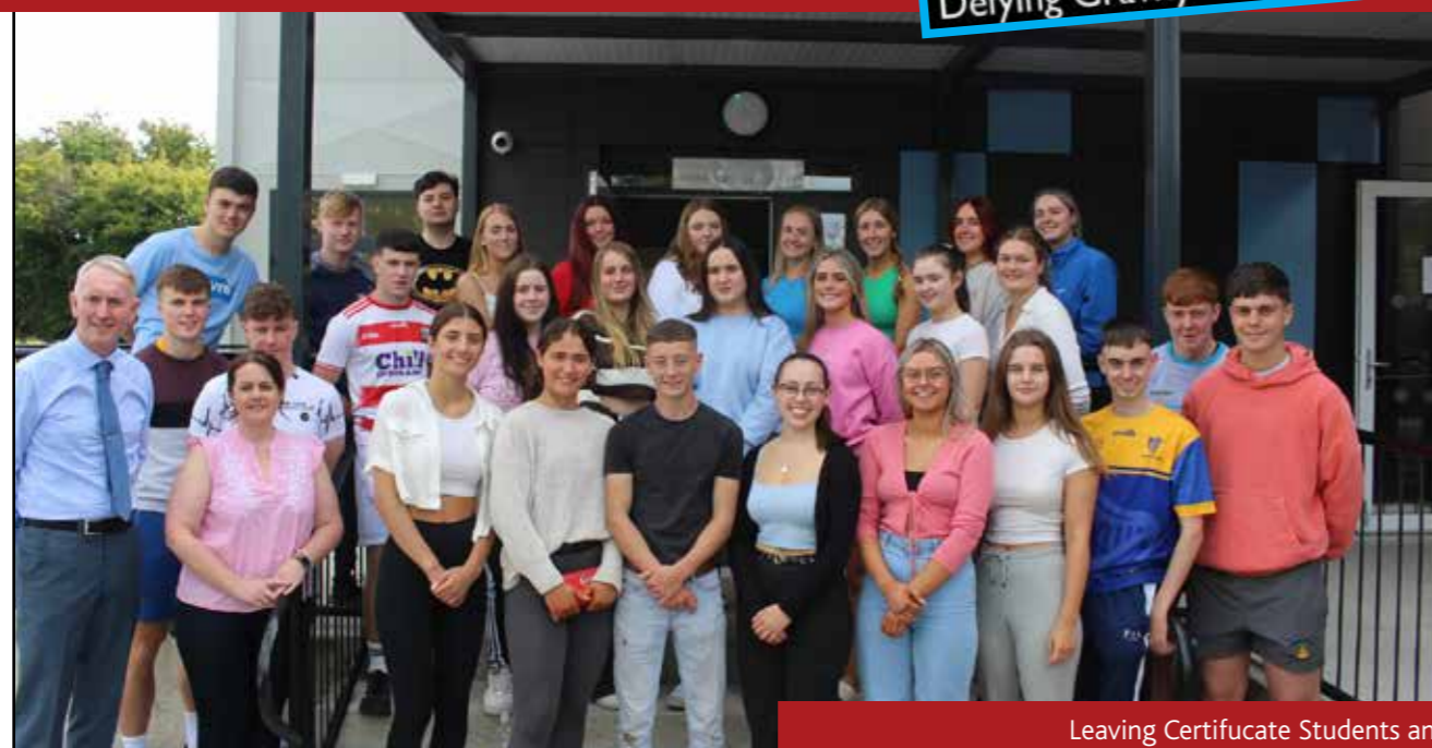
Leaving Certificate Students and Staff

"I always felt there was something for everyone in Cashel Community School – this is a vivid memory for me – the ability for me to be myself. This allowed me to grow into a more confident person"