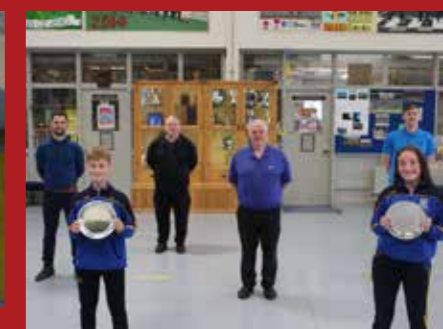
Soccer Scholarship Winners