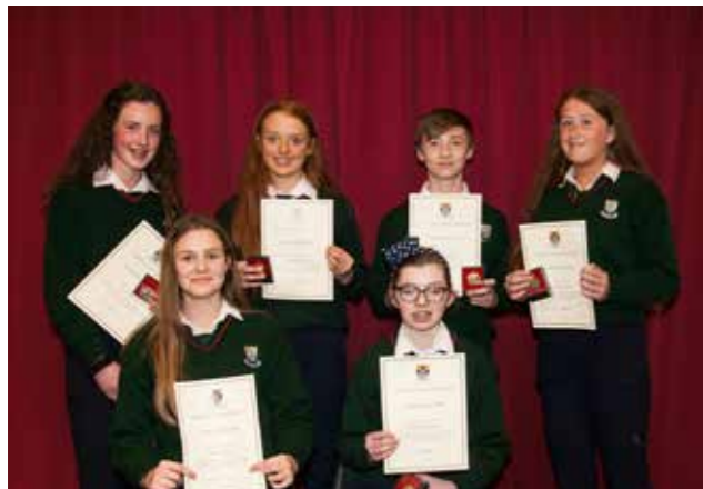
CCS Awards 2019